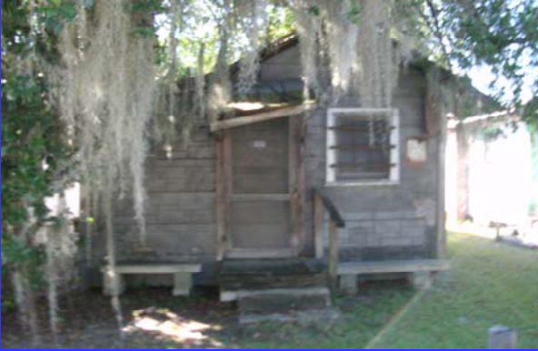
Unoccupied, unsafe structure

A Full Time Code Enforcement Officer dedicated to the CRA was added this year. This has generated 50 new Code Enforcement Cases within the CRA, of which 44 cases have voluntarily complied with compliance requests. There are 6 cases that are actively being pursued by the Code Enforcement Board.